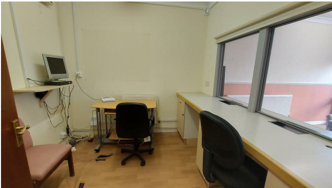
Office 8'10" x 8'6" (2.7 x 2.6)

Skimmed and covered ceiling, skimmed walls, wood effect vinyl flooring and radiator.