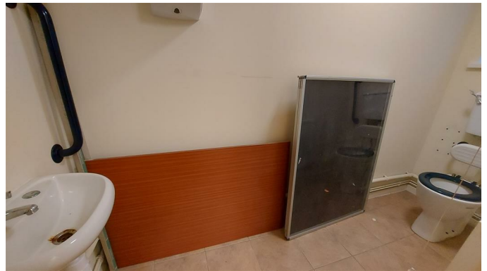
W.C 9'10" x 3'3" (3.0 x 1.0)

Skimmed ceiling and walls, tiled flooring, radiator, uPVC double glazed window with obscured glass to side and a two piece suite comprising a low level W.C and wall mounted wash hand basin.