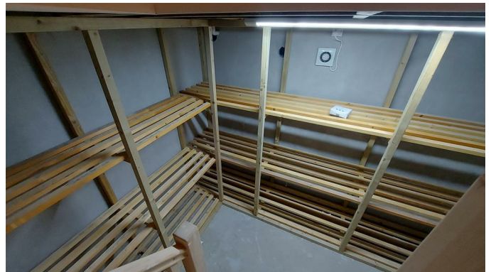
Basement 9'10" x 8'6" (3.0 x 2.6)

Concrete walls and floor, fitted with wooden storage racks.