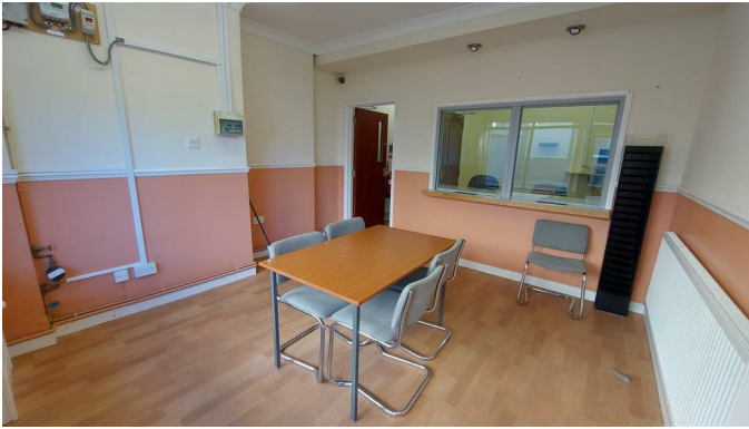
Trading Area 13'1" x 11'5" (4.0 x 3.5)

Entry via glazed door. Skimmed and covered ceiling, skimmed walls, wood effect vinyl flooring, radiator, large shopfront window, security window looking into office and door to: